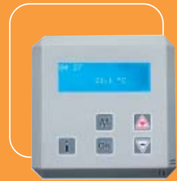
MultiTherm C (art.nr. IX.3912)