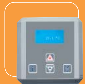
MultiTherm S (art.nr. IX.3911)